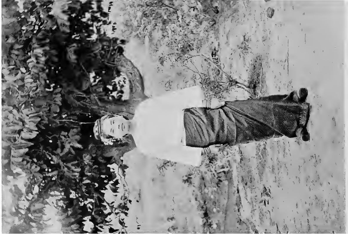
A Burmese Girl